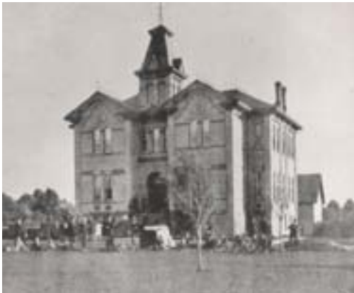
Aylmer Secondary School circa 1900

You can hike or bike your way through a self-guided tour of Aylmer's Heritage Buildings and places of interest. The tour highlights homes, businesses and places of worship that have been recognized by the Aylmer Heritage Committee. Pick up your Heritage tour map and booklet!